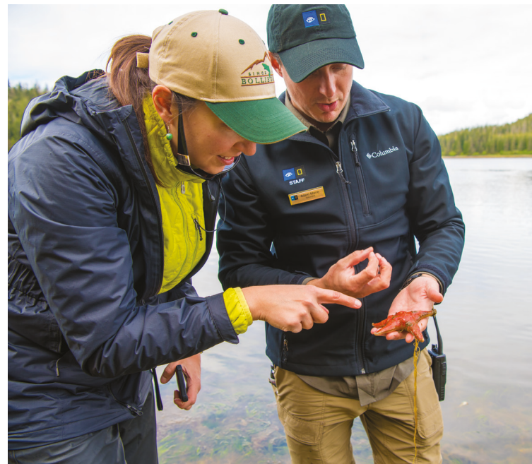
From left to right: Emperor penguins sit atop an ice crevasse, Antarctica; A Lindblad Expeditions field staff member illuminates the natural wonders of Alaska for a guest.